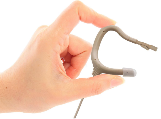
EO2-8WL Dual Element Earmount Microphone

Dual Element: Waterproof Back Electret Condenser