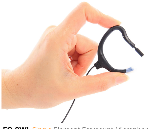
EO-8WL Single Element Earmount Microphone