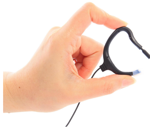
EO-8WL Single Element Earmount Microphone

Included Accessories: Windscreen, SLIDER1 cable clip, alligator cable clip, storage box