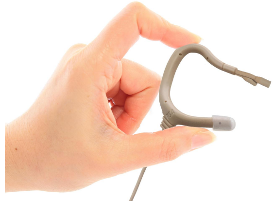
EO2-8WL Dual Element Earmount Microphone

Dual Element: Waterproof Back Electret Condenser